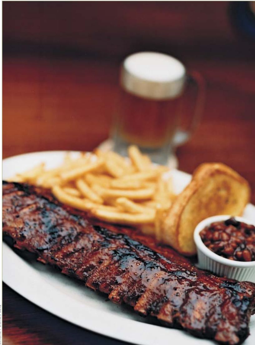
SMOKEY BONES BBQ

OPERATIONS LIKE SMOKEY BONES BBQ REALIZE THAT SMOKING ADDS FLAVOR AND VALUE TO A VARIETY OF MENU ITEMS, FROM MEATS AND SEAFOODS TO VEGETABLES AND CHEESES.