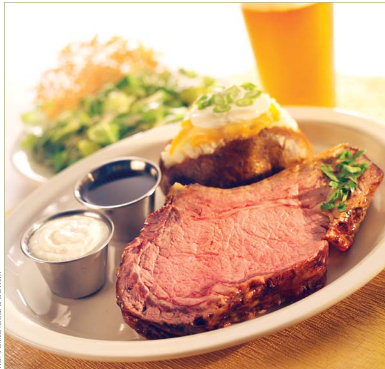
HOPS GRILLHOUSE & BREWERY

Inventive chefs and menu development professionals are proving that the prehistoric